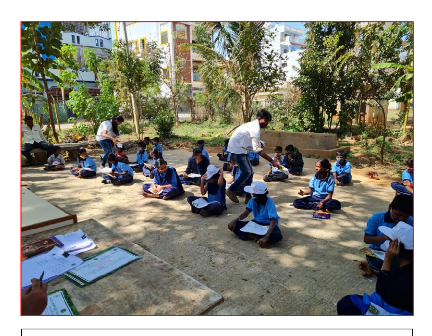
Distributed T-shirts and Caps to the students