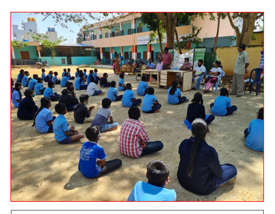
Block education officer doddaballapura interacted with children about conservation