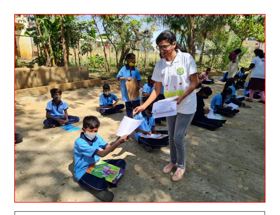
Conducted Wet Land Day quiz competition to students.