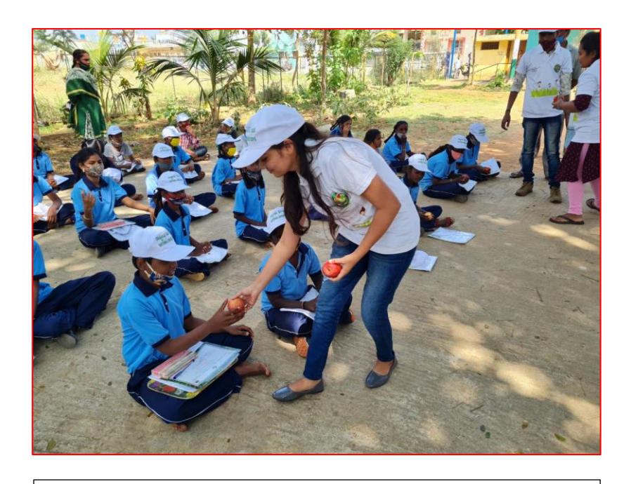
Refreshment distribution for students